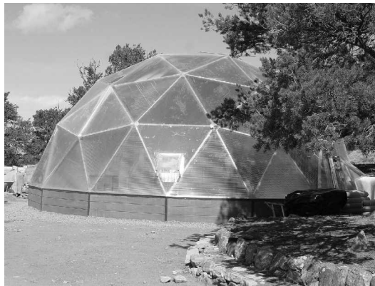
The Sanctuary House Growing Dome-erected March 26 &27: